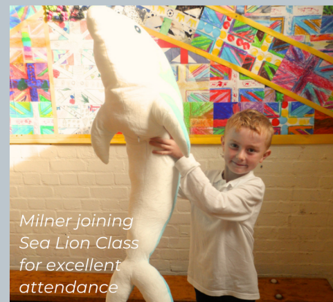
Milner joining Sea Lion Class for excellent attendance