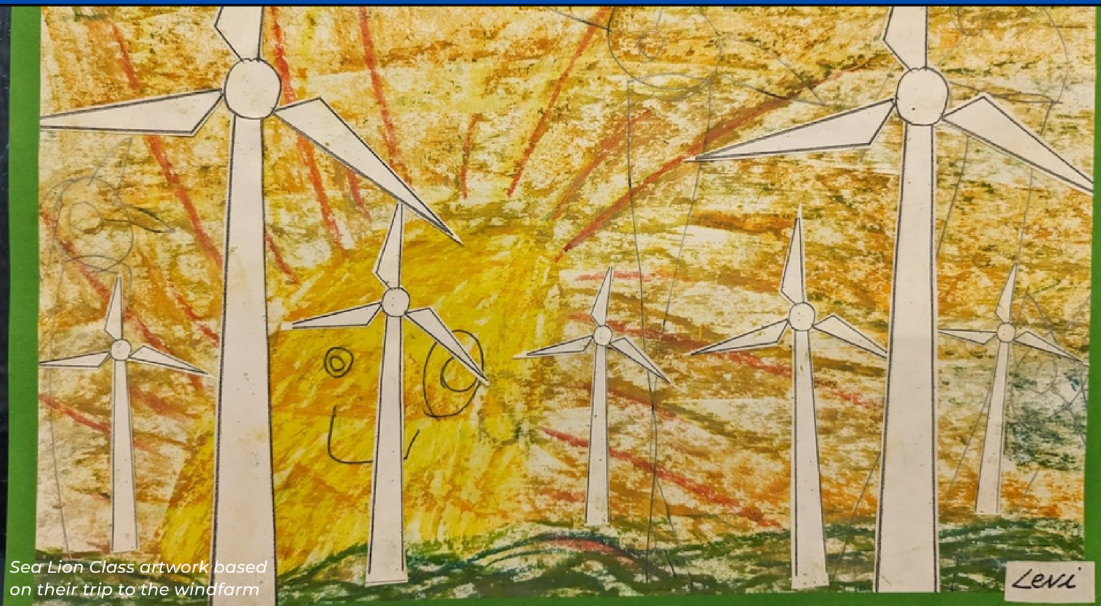
Sea Lion Class artwork based on their trip to the windfarm