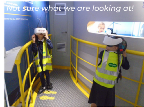
Not sure what we are looking at!

We learnt a lot about renewable energy, and enjoyed eating lunch by the sea.