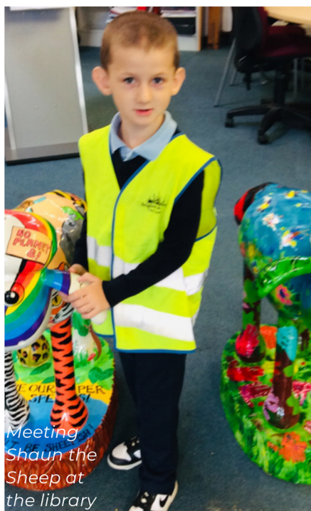
Meeting Shaun the Sheep at the library

The children selected books and enjoyed reading and listening to stories.