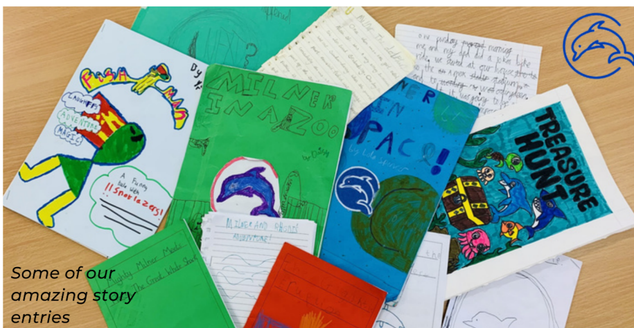
Some of our amazing story entries