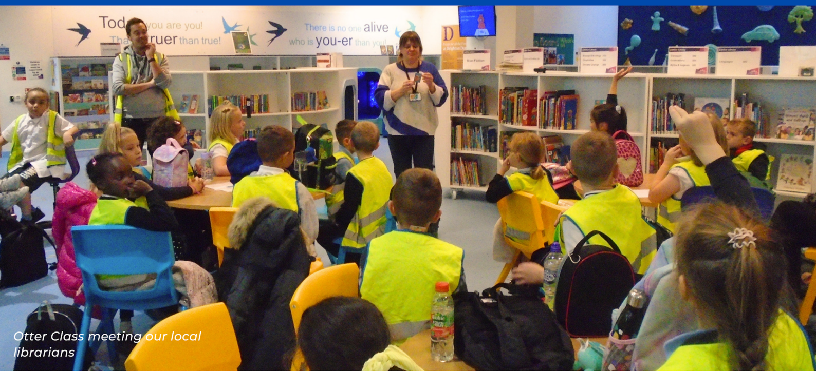
Otter Class meeting our local librarians