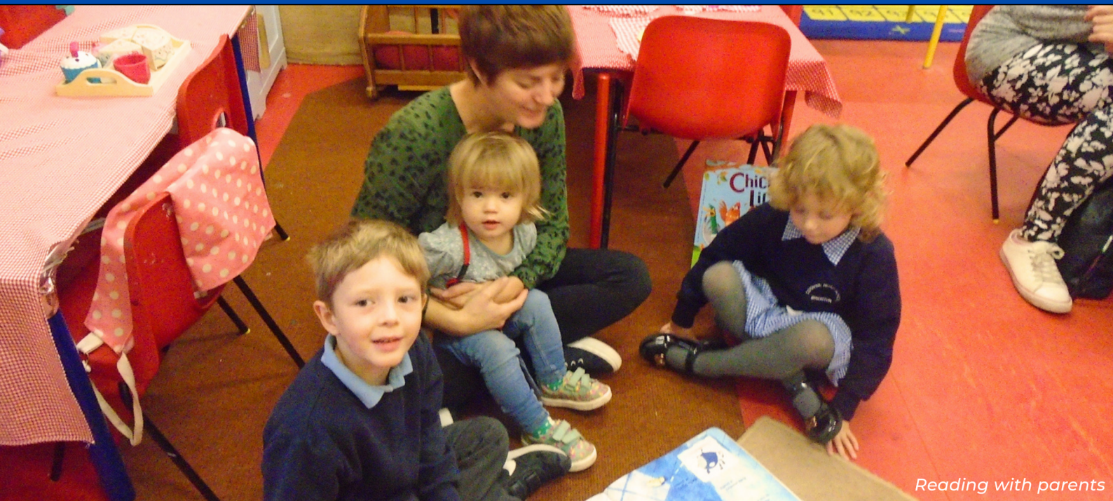
Reading with parents