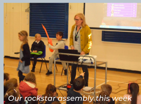
Our rockstar assembly this week

Maths fluency and times table skills remain a school priority. We had our rockstar assembly this week and celebrated the children's progress. Please support your children at home to learn their times tables.