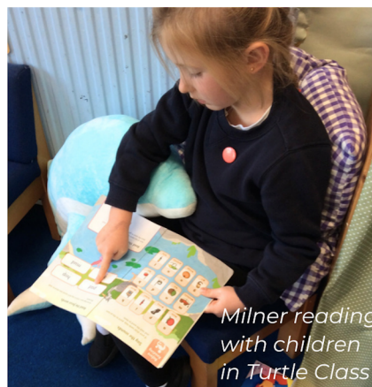
Milner reading with children in Turtle Class

Our school now has two dolphin mascots: Milner and Coombe.