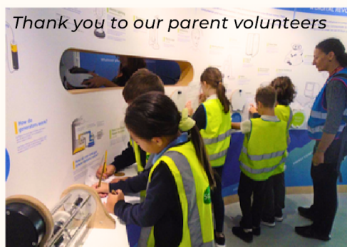
Thank you to our parent volunteers

We are having a geography curriculum focus this year and year 4 visited the Windfarm Visitor Centre. They had an excellent day - full of interactive activities, led by the staff in a state-of-the-art museum on the beach.