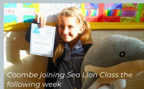
Coombe joining Sea Lion Class the following week

42 DAYS OF LEARNING HAVE BEEN MISSED THIS HALF TERM BECAUSE OF HOLIDAYS BEING TAKEN DURING TERM TIME