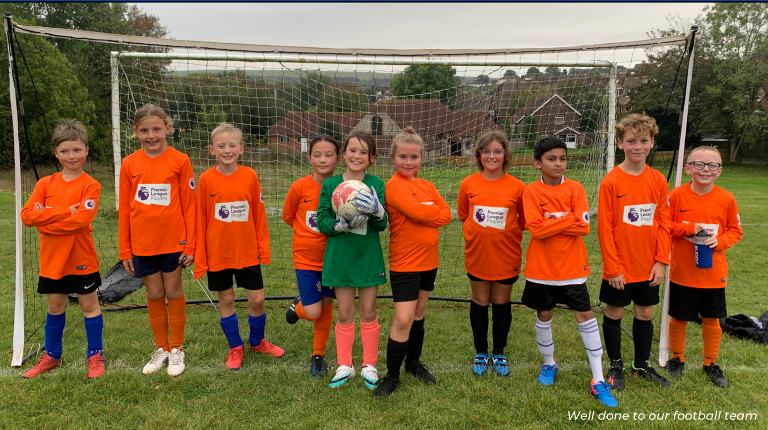
Well done to our football team