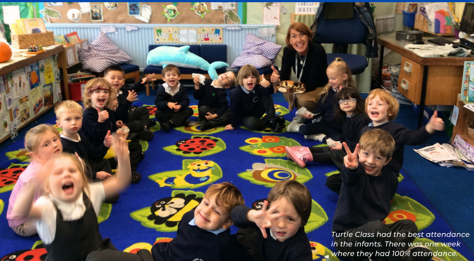
Turtle Class had the best attendance in the infants. There was one week where they had 100% attendance.