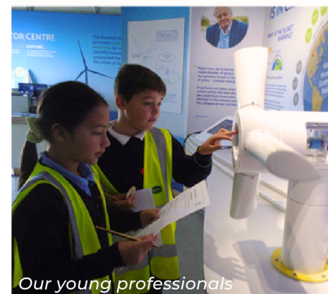
Our young professionals

We learnt a lot about renewable energy, and enjoyed eating lunch by the sea.