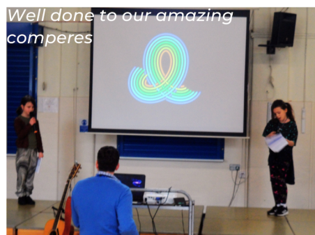
Well done to our amazing comperes

The team really did the school proud and some of our children showed immense courage in getting up onto the stage and performing for the first time.