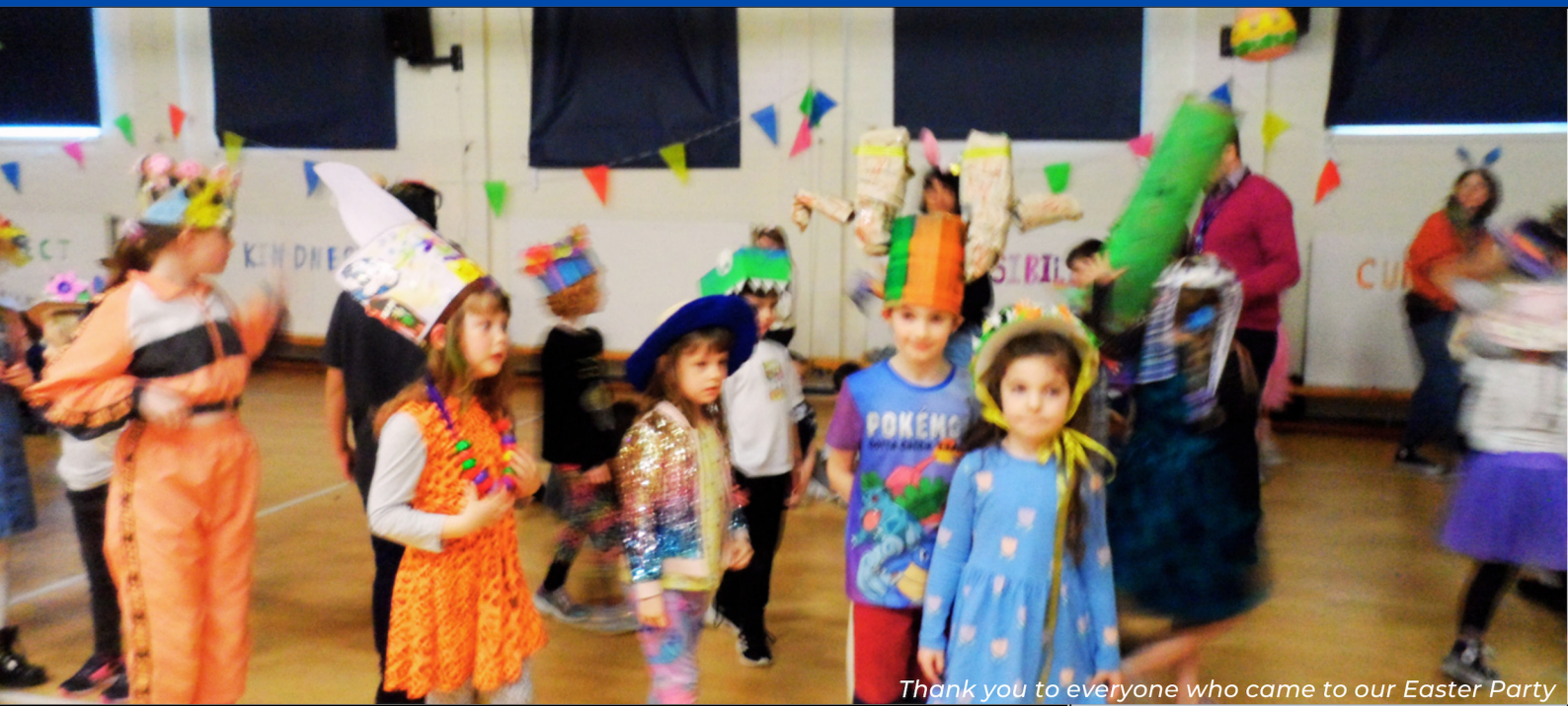
Thank you to everyone who came to our Easter Party