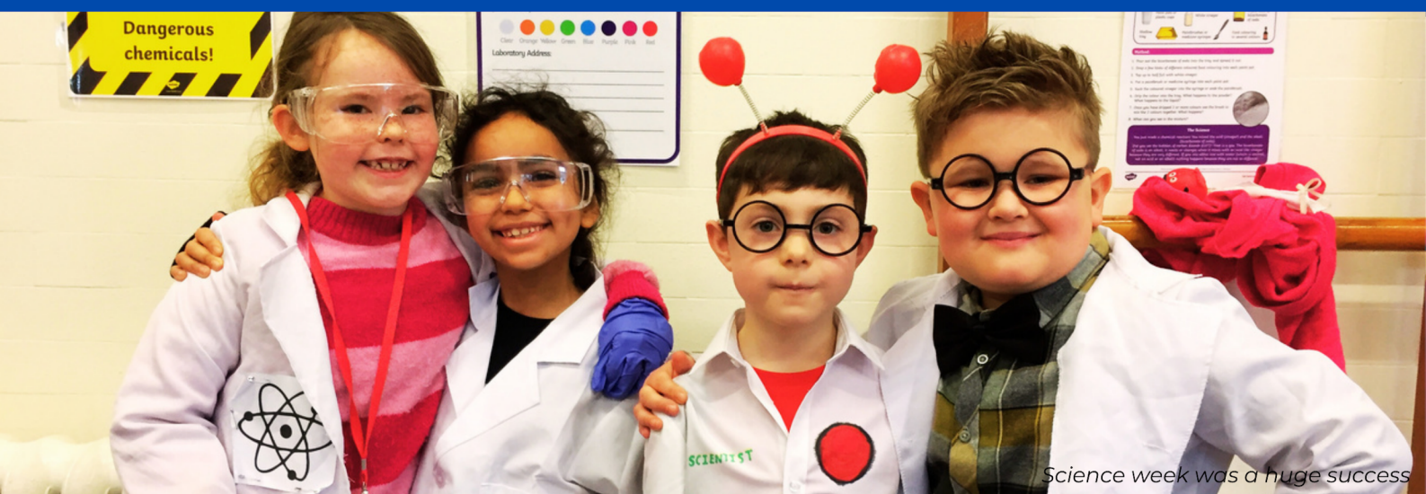
Science week was a huge success