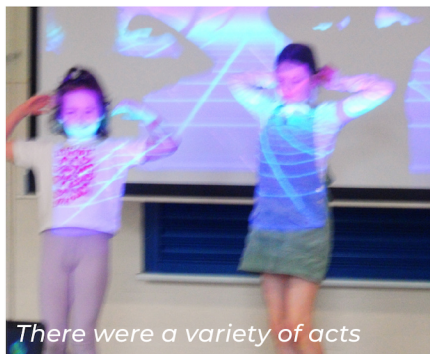
There were a variety of acts