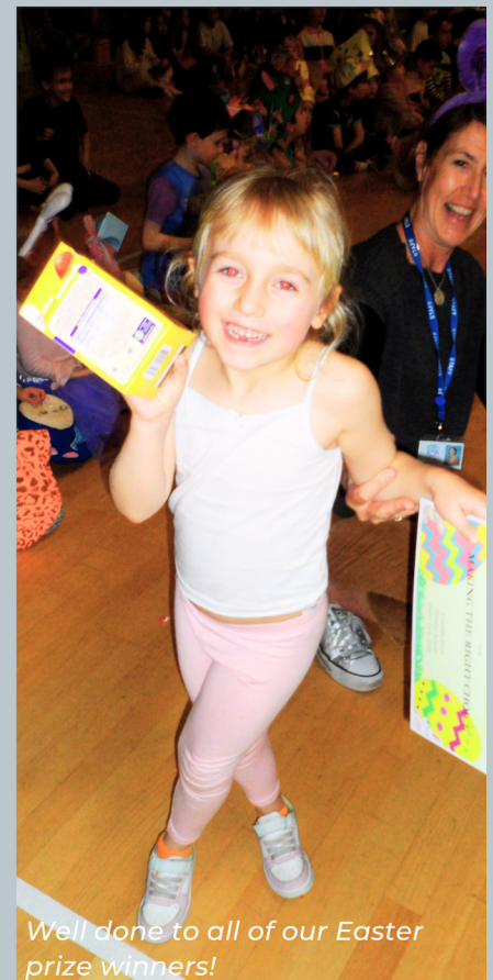
Well done to all of our Easter prize winners!