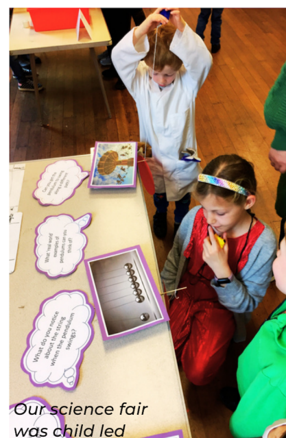
Our science fair was child led