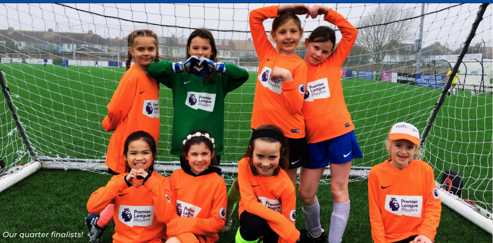
Our quarter finalists!