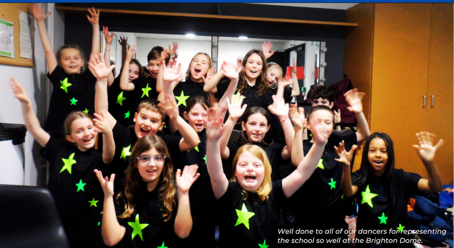
Well done to all of our dancers for representing the school so well at the Brighton Dome.