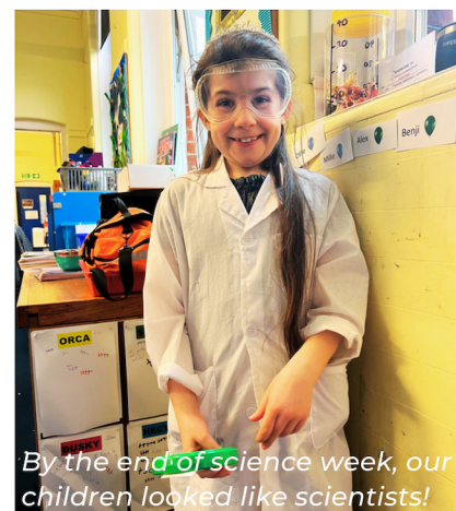
By the end of science week, our children looked like scientists!

Our years 4s have been designing clothing in the style of famous designers, like these Coco Chanel hats.