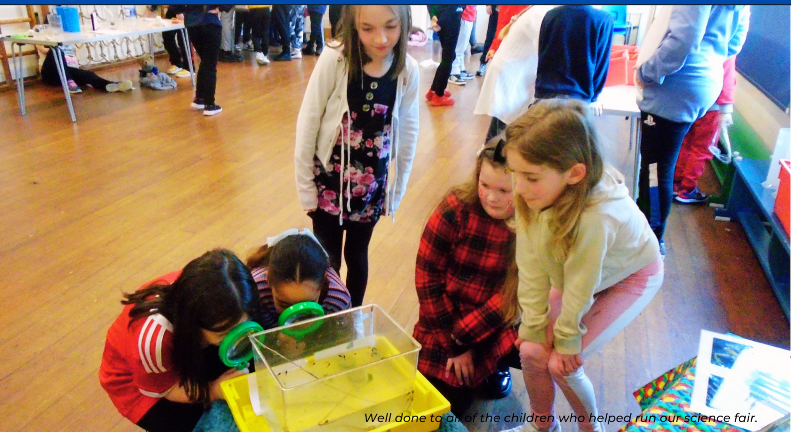
Well done to all of the children who helped run our science fair.